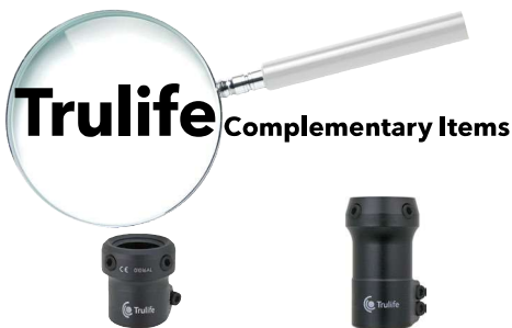
AAA225 Clamp Adapter (page 26)